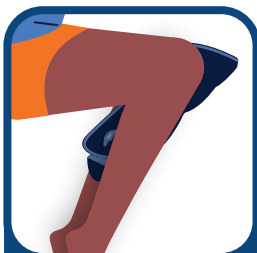
BETWEEN THE KNEES