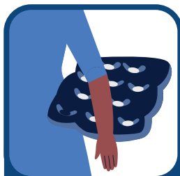
UNDER THE ELBOW