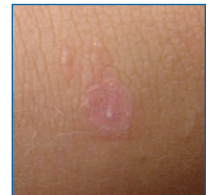
TWO WEEKS AFTER TREATMENT