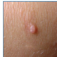
COMMON WART BEFORE TREATMENT