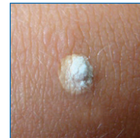
IMMEDIATELY AFTER TREATMENT